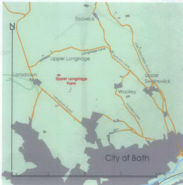
Location of upper Langridge Farm