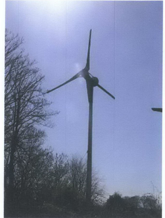
The Proven 15kw turbine

24 At a total height of 19.5m it is 4-5m smaller than either of the machines with equivalent annual output. A physically smaller turbine, the Proven 6 is available, but neither this nor the Westwind 10 is capable of meeting any significant proportion of the annual demand. To produce the same annual generation with smaller turbines would require 3No Proven 6 or 2No Westwind 10 at